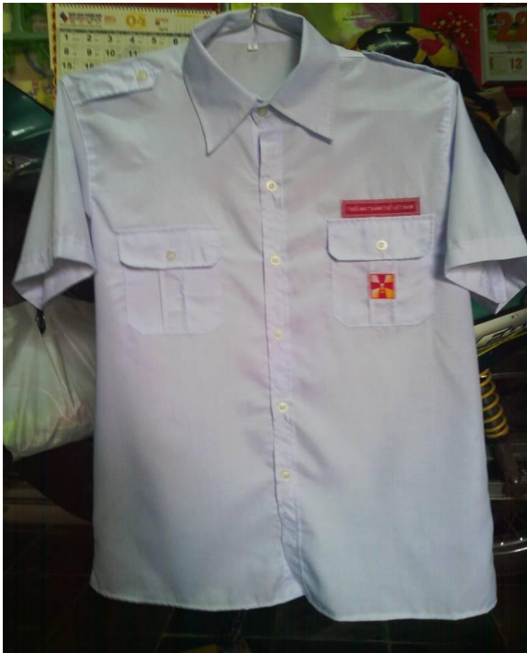
This is a picture of a white, buttoned collar shirt.

An image below shows a white, buttoned, collar shirt uniform: